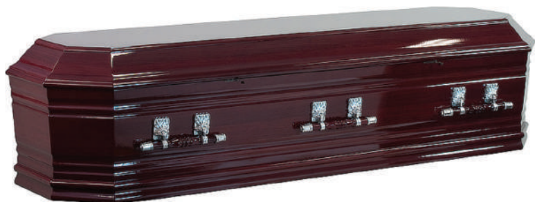
GRECIAN URN Rosewood