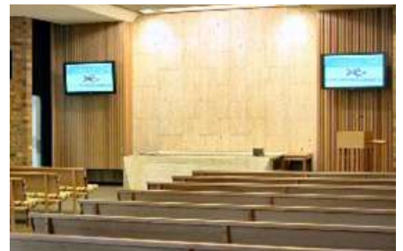
The Cordell Chapel (seats 140)