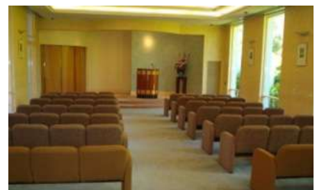
The Chapel of Repose (seats 80)