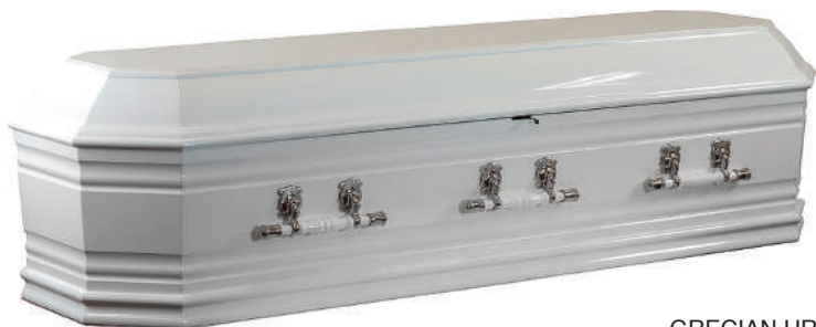
GRECIAN URN White