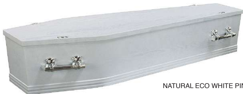
NATURAL ECO WHITE PINE