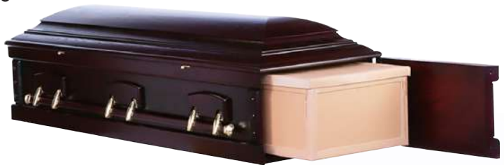
Rosewood Rental Eco Casket