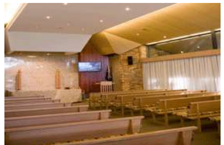
The Joyce Chapel (seats 140)