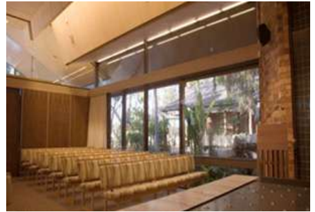
The Crick Chapel (seats 70)